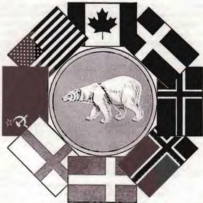
A circumpolar confidence-building regime should be developed in the Arctic and an international arctic monitoring agency is a potential first step.

formalized or informal framework would be a welcome development. The sharing could begin with surface events of a benign nature, such as the exchange of environmental and climatic information. As new monitoring systems are developed or converted from military use, they could be offered (or sold) to the agency. Gradually the agency could provide more extensive coverage of the arctic region, beginning with international territory and then expanding to include national territories, as requested by participating states. The creation and development of the agency would provide a significant test of the declared Soviet intention to create a zone of peace in the Arctic.