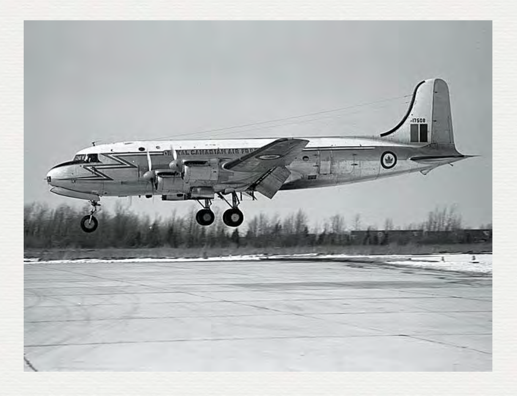
North Star CF Photo