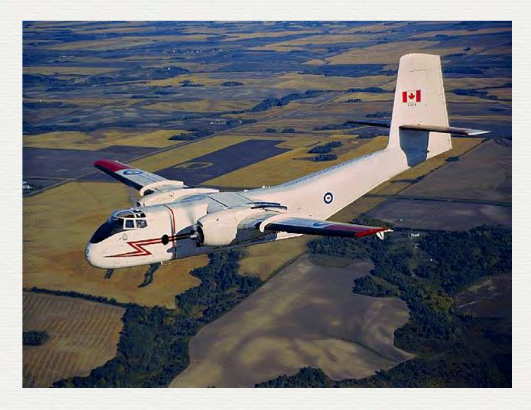
de Havilland CC-108 Caribou CF Photo