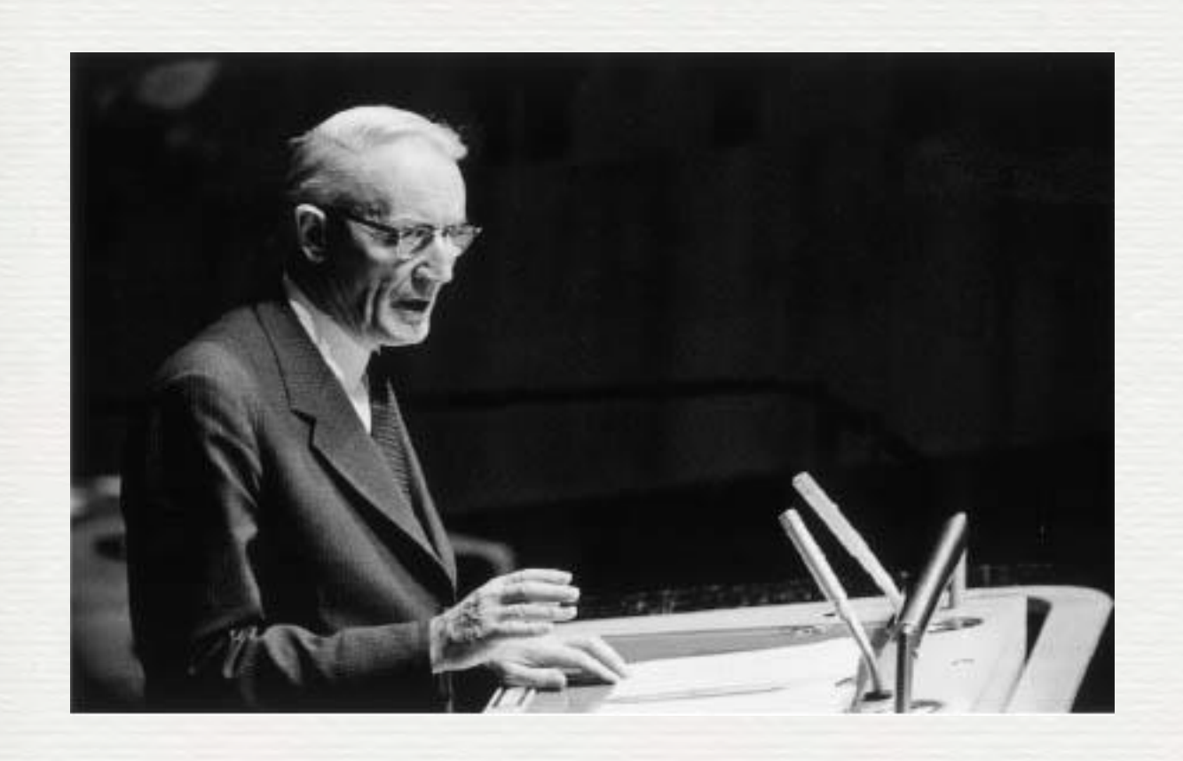
Howard Green Secretary of State for External Affairs