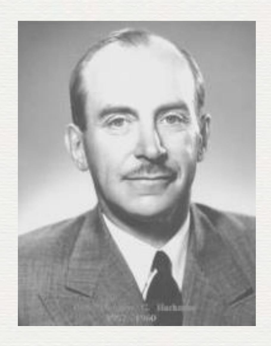
Douglas Harkness Minister of National Defence