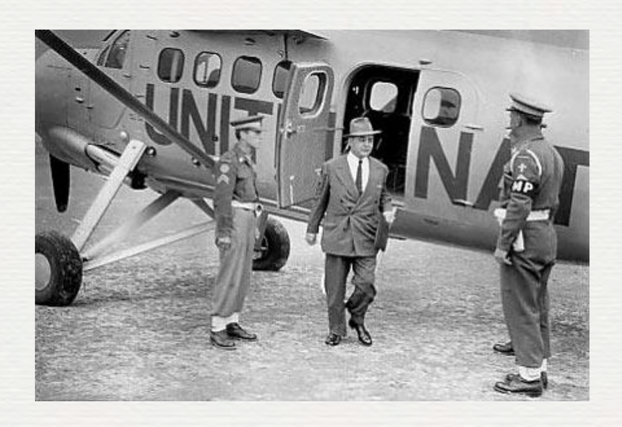
Ralph Bunche United Nations Under-Secretary