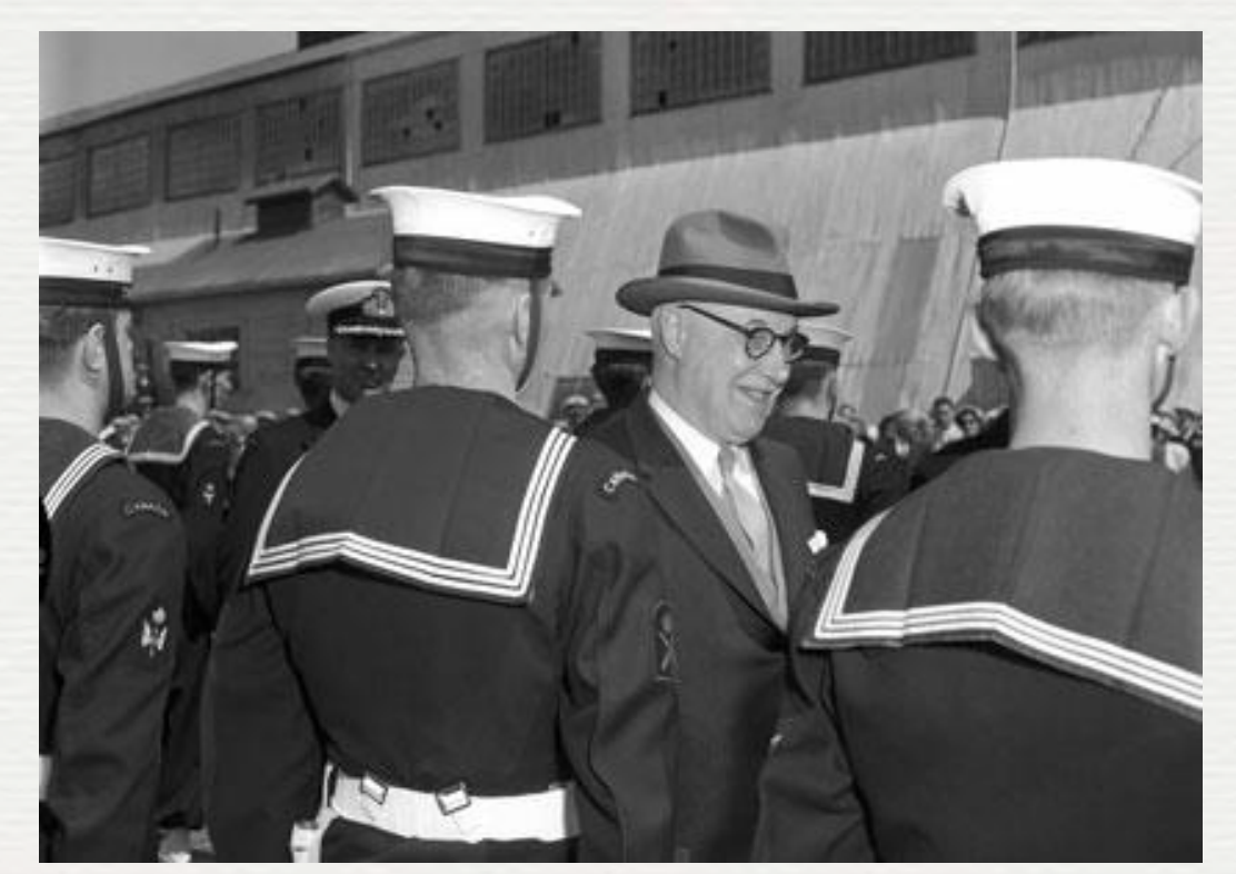
George Pearkes Minister of National Defence